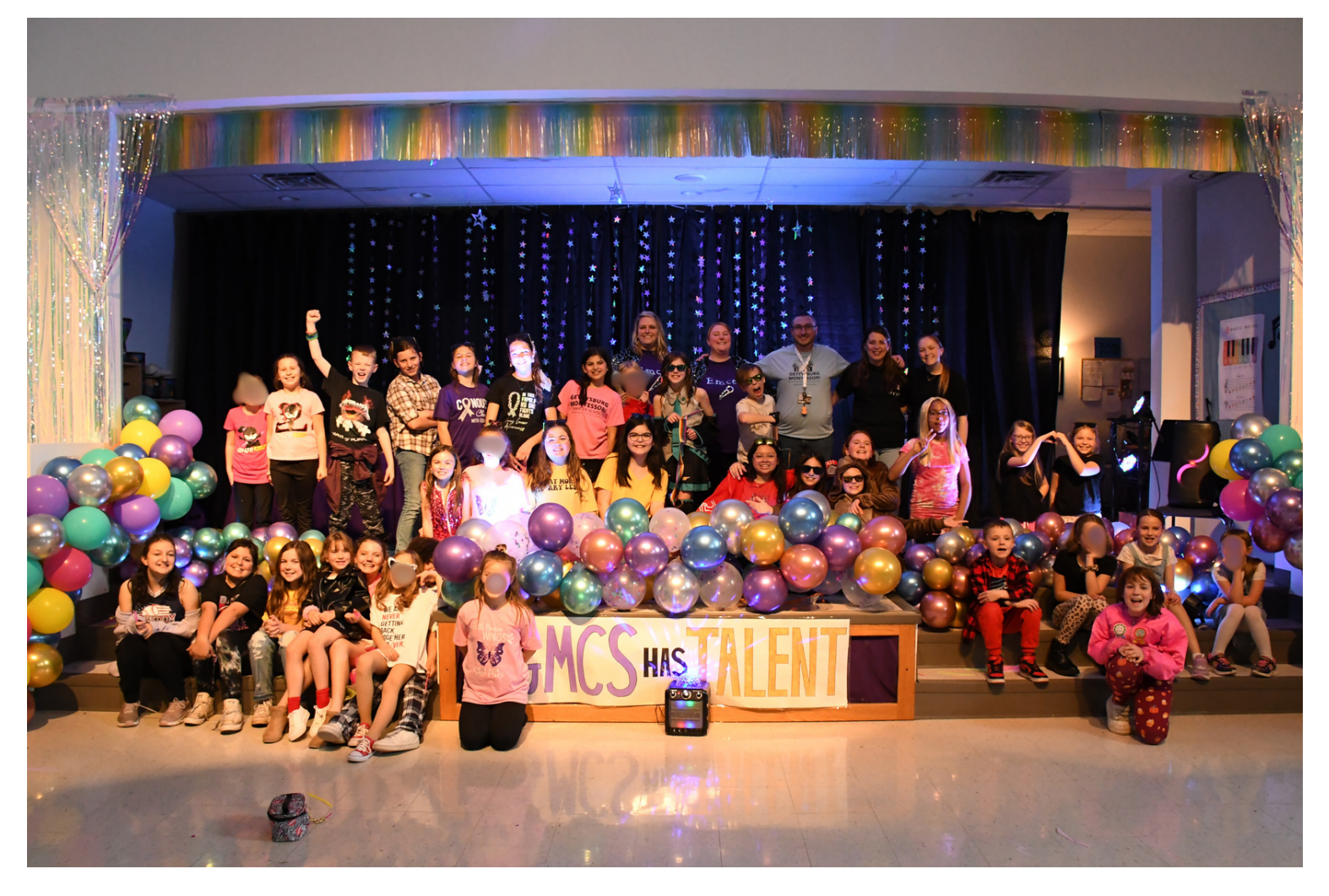
GMCS Talent Show: A Spectacular Success!

The GMCS Talent Show was bursting with creativity, courage, and incredible performances! From singing and dancing to comedy and more, our students truly wowed the crowd. The event was a shining example of the amazing spirit and talent within our school community.